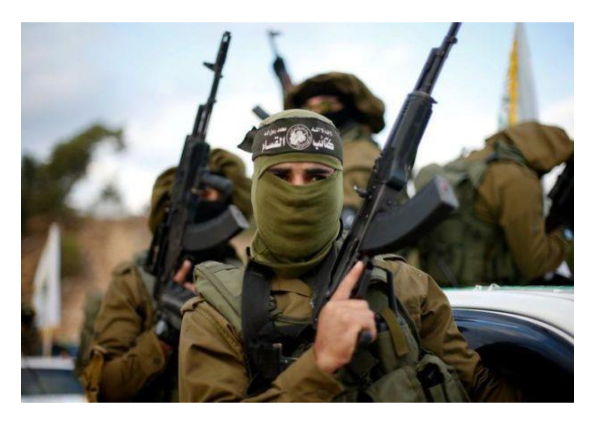
164. Mr. Anglin posted a clip of the song "Be Prepared" from the Disney film The Lion King , and wrote, "And they will rue the day, as they see two hundred skinhead Alt-Right Nazis marching with a guy from Hamas carrying machine guns through the center of their town!"

165. Mr. Anglin concluded his article with a photograph of armed Nazis marching: