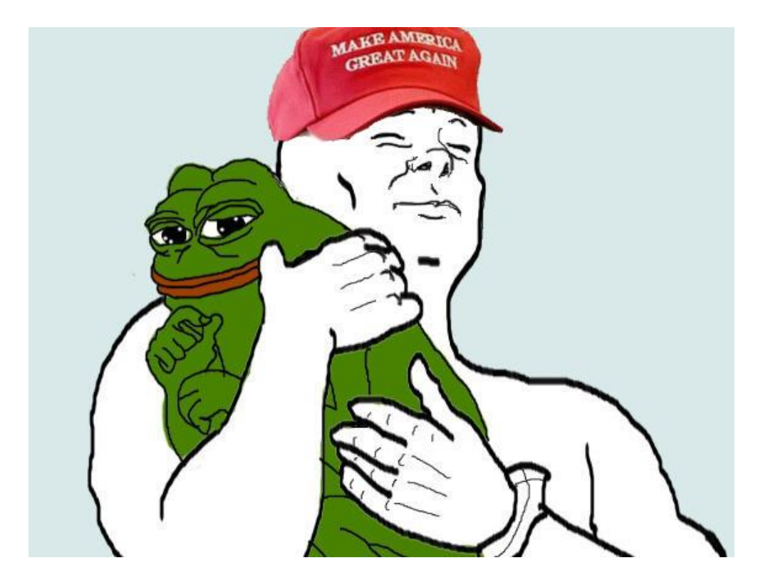
January 8, 2017 Articles

168. The article opened with an image of Donald Trump hugging Pepe the frog, an alt-right meme: